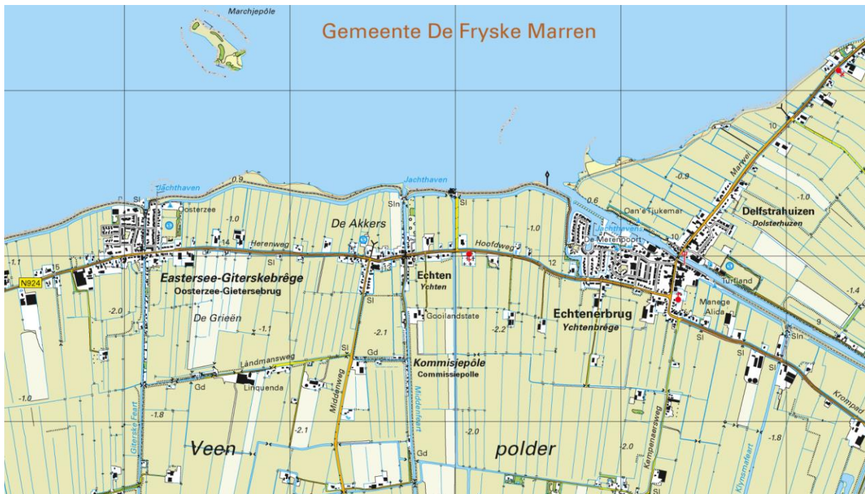
Figure 3 - Detail from the 1:25 000 map series of the Netherlands, with a part of Frisia, showing Frisian names of populated places in italics; the first name in a name pair would be the official name. When there is no official name, as is the case for Kommisjepôle – Commissiepolle, priority has been given to the Frisian name.